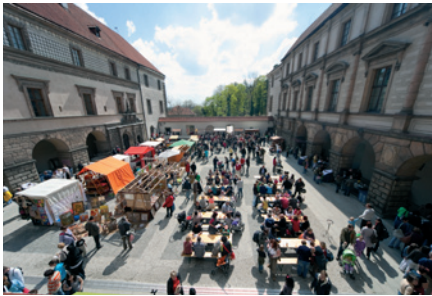
Guests enjoying the sun at the courtyard

Come celebrate the Bohemian tradition of pottery-making and the start of the spring season at the 11 th annual Spring Pottery Market: