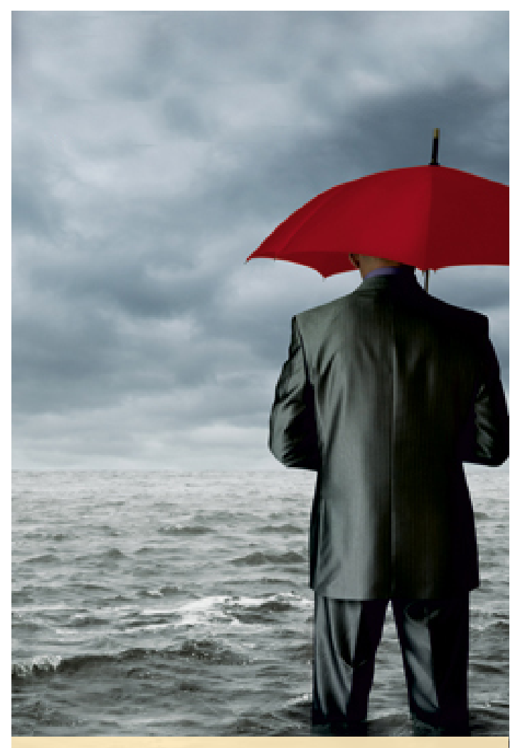
4th Annual Credit Risk Management Conference