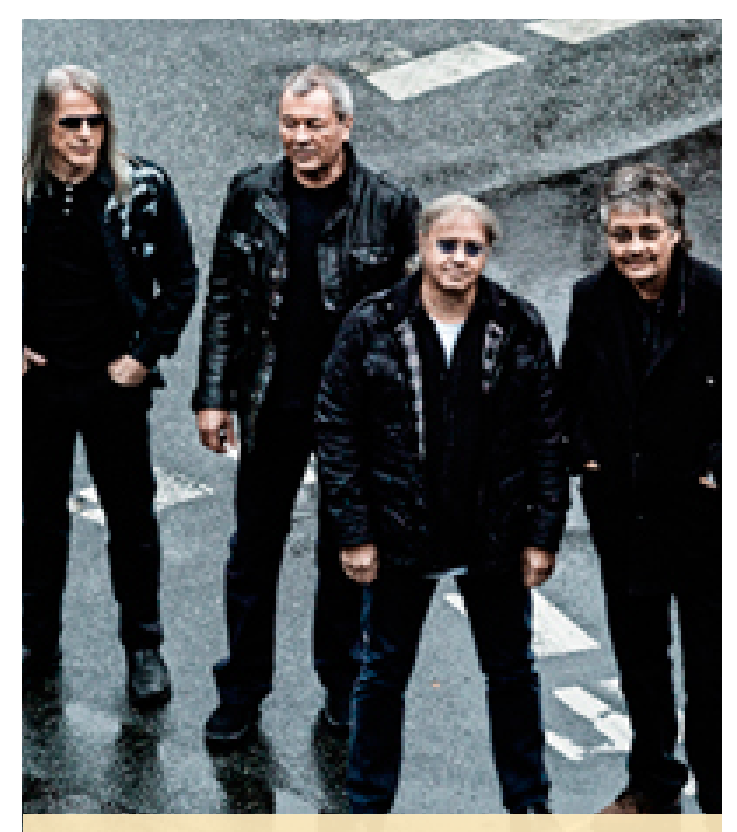
Black Sea coastal Kavarna Hosts Rock Fest with Deep Purple