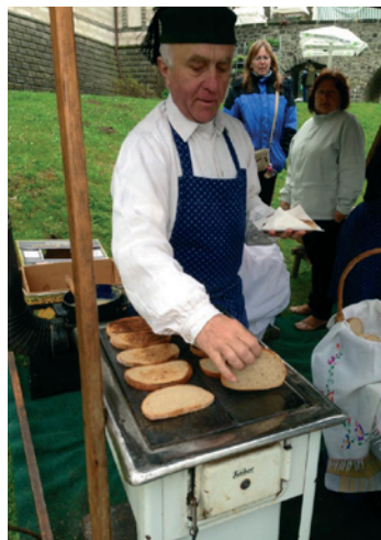
A vendor preparing traditional Czech "topinky" – homemade grilled bread brushed with fresh garlic