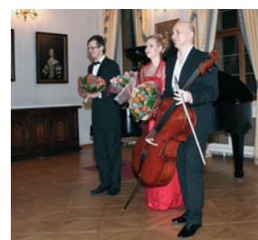
Ensemble Maurice after the concert at The Lobkowitz Palace