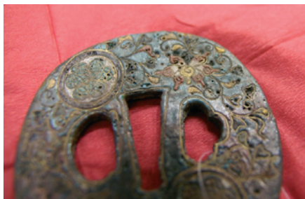
Cloisonné tsuba, ca. 1840, maker unknown, Japan, iron and copper engraving

It's an ancient Japanese sword guard, most likely made by the Hirata School using one of their trademark cloisonné designs. Its main function is to balance the weight of a sword, but we presume it was made for ceremonial purposes as it's too thick and heavy to be useful in battle. The fact that it came all the way from Japan