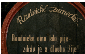
Roudnice Lobkowitz Winery