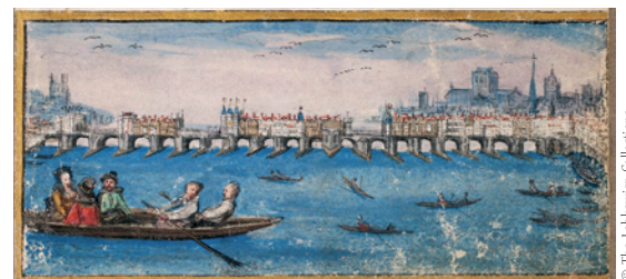
Early 17 th century Memory book of aristocrat Georg Leopold von Stadl: London – View of London Bridge (painted 1611)

The exhibition presents 17 th century memory books — whimsical travel souvenirs of young aristocrats from the European continent or from distant lands. The volumes contain inscriptions and signatures of various persons the traveler met on his journey. These books are completed with drawings of visited towns, their inhabitants, pictures of memorable events, as well as coats-of-arms of the authors, and their cherished travel memories. (Runs April–October 2013).